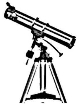
4.5 inch reflector on an equatorial mount (beginner to intermediate)

The recipient of this award will receive, for one year , a loaner telescope and supporting accessories from the Madison Astronomical Society (MAS). The applicant should specify which telescope they are most interested in receiving, and indicate their level of previous experience using telescopes. Applicants must be in grade 9 through 12 for the school year in which they receive the scholarship.