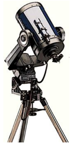
8 inch Meade Schmidt Cassegrain on a fork equatorial mount (advanced)